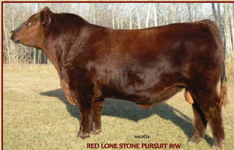
RED LONE STONE PURSUIT 81W