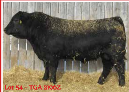
Lot 54 - TGA 2196Z