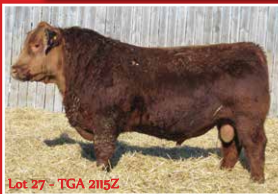
Lot 27 - TGA 2115Z