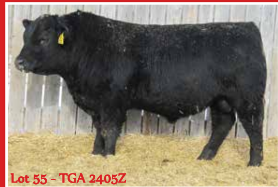
Lot 55 - TGA 2405Z