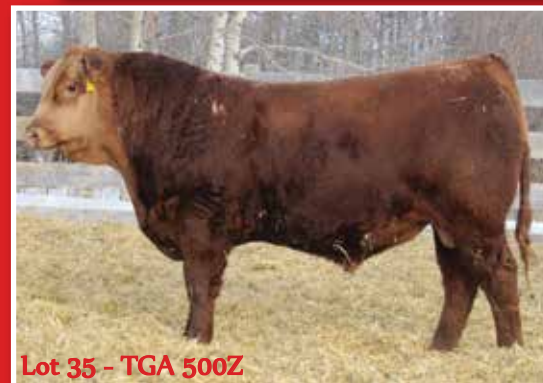
Lot 35 - TGA 500Z

A big thank-you to all buyers, bidders and everyone in attendance who helped make our 2013 sale such a great success!