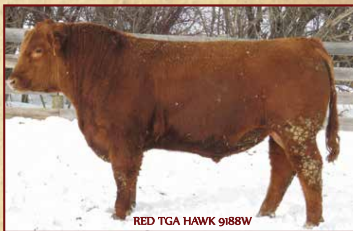
RED TGA HAWK 9188W