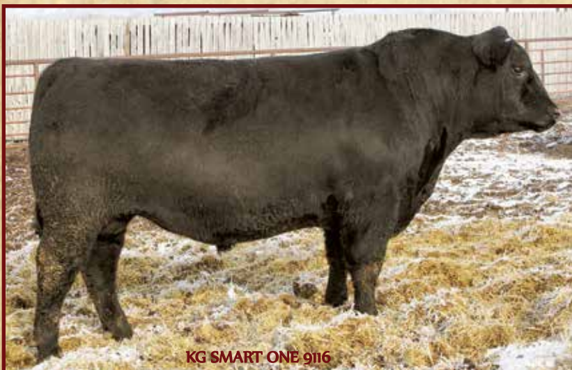
KG SMART ONE 9116